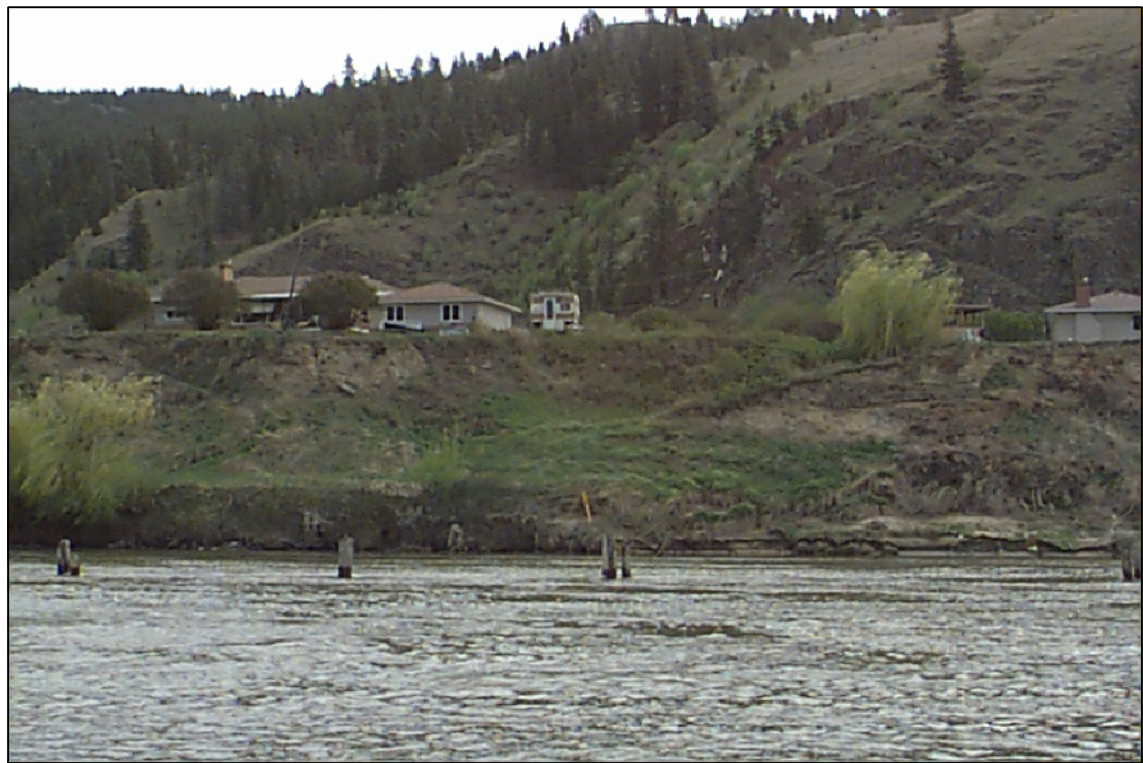
LEFT BANK VIEW