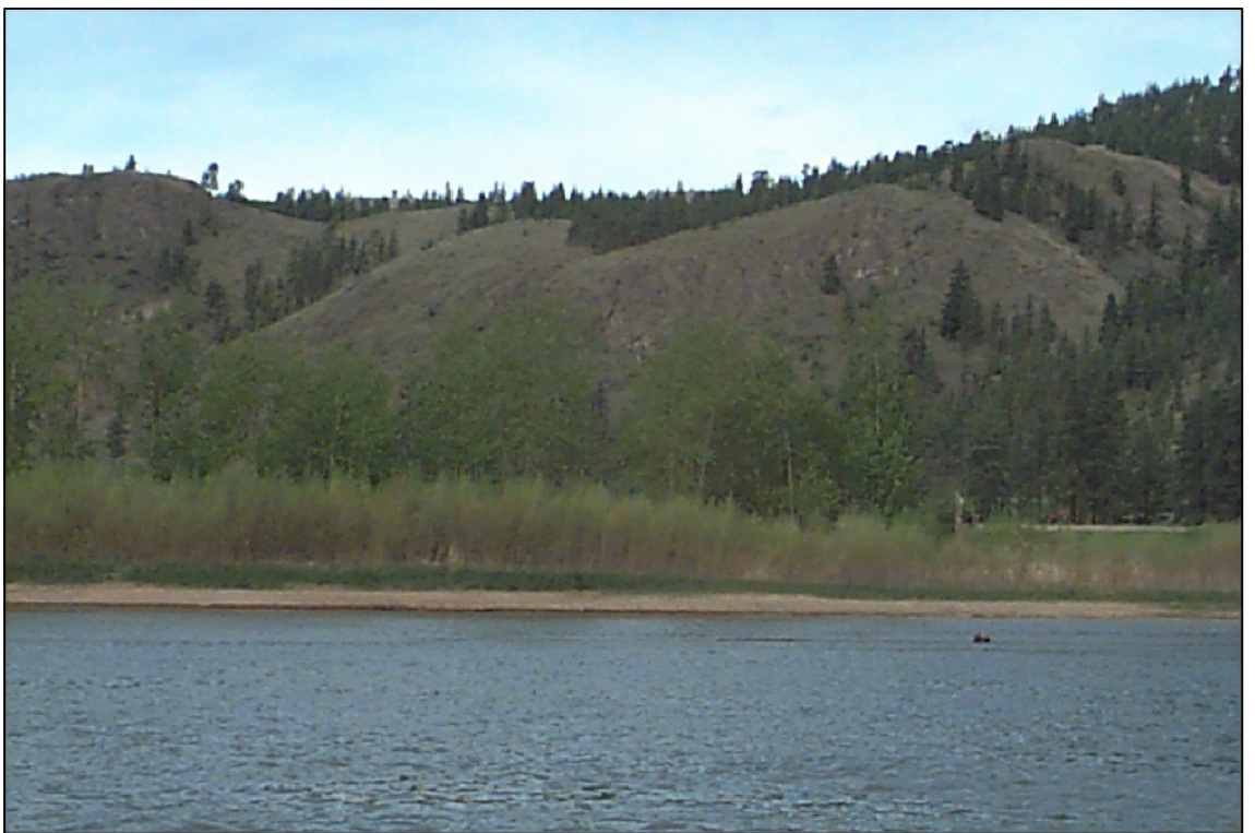
RIGHT BANK VIEW